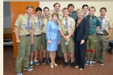
Congratulations Troop 390 Eagle Scouts!