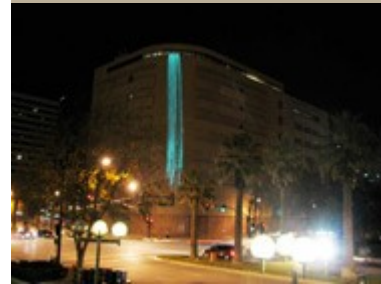
Particle falls Click here for details