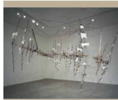
Aerial Mobile Click here for detail

Thursday, October 7th; 5:30pm County Government Center; 70 West Hedding Street