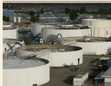
Plant Digester Tanks Need Rehabilitation

Live local Bay Area bands perform a variety of music from alternative to classic rock, punk, funk and blues to jazz it up because music makes up the heart and "sole" of this event! Bands play at every mile of the run and are also featured at the post race concert—this year the headliner is Blues Traveler. The bands set the tempo for this 13.1 mile party, where runners and spectators alike dance in the streets to these free mini-concerts! For more information visit: http://san-jose.competitor.com/ .