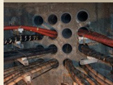
Plant Electrical Systems Need Improvements