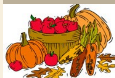
Harvest Festival at Almaden Community Center on