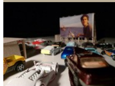
Empire Drive In Click here for details