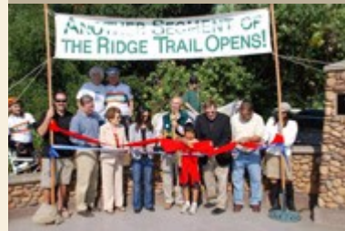
Bay Area Ridge Trail Dedication