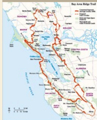
Bay Area Ridge Trail