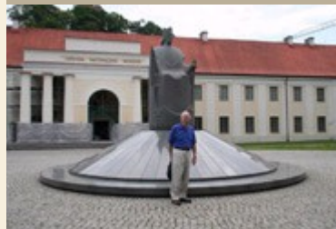
Lithuanian National Museum