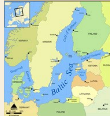
Baltic Sea Region