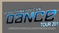
So You Think You Can