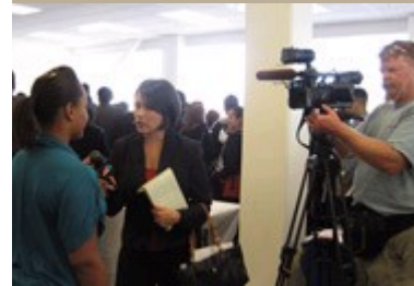
NBC covers Job Fair & interviews students