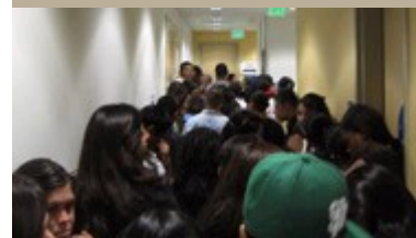
Over 200 students attended the Youth Job Fair