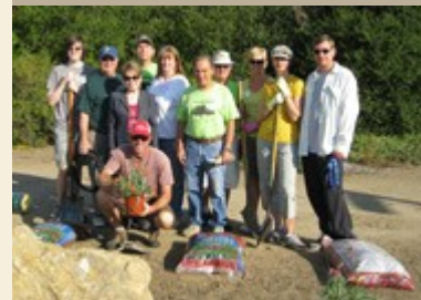
20 trees and about 130 small shrubs were planted by neighborhood volunteers.

The Martin-Fontana Parks Association had over 100 volunteers attend their work day at Jeffrey Fontana Park on October 15.