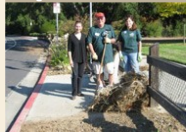
Additionally, weeds were removed from the park entrance on Meridian Avenue.

Thanks to all involved for your hard work!