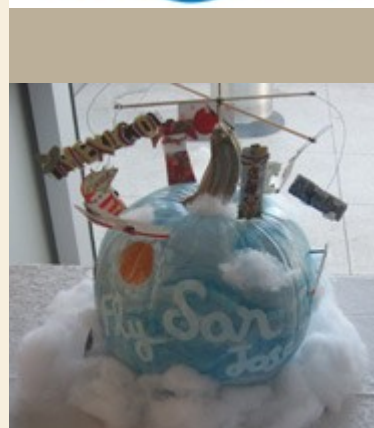
The District 10 team created this pumpkin featuring our motto: Fly San Jose!