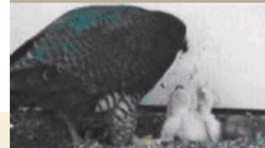
Click here to help us name the new falcons!