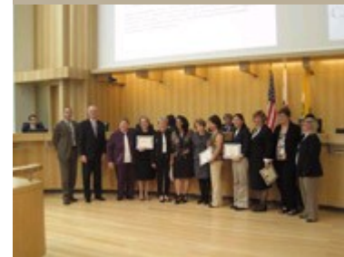
Early Care and Education Outstanding Contributors honored at City Council