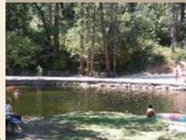
San Jose Family Camp