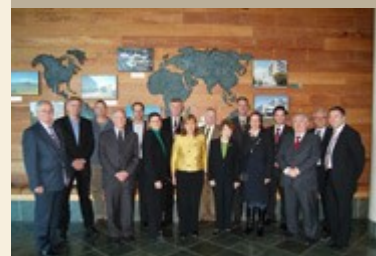
2010 San Jose –Dublin Sister City visit