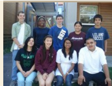
San Jose Youth Commission

To find a VITA site near you, download the VITA Sites and Schedules pdf or dial 2-1-1 from any phone in Santa Clara County. Most sites are walk-in (no