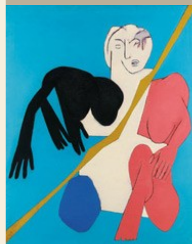
This is a Tyeb Mehta piece from his Diagonal Series on display now at the San Jose Museum of Art