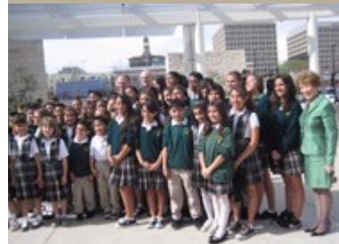
The St. John Vianney Children's Choir at the 2011 San Jose –Dublin Sister City Flag Raising

Mid-March 2011 Newsletter print version is available here