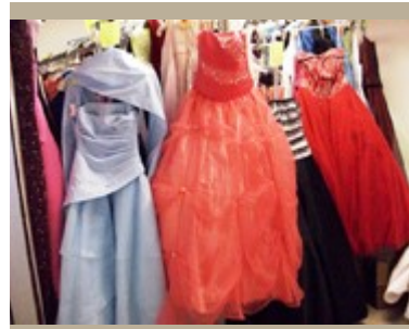
Prom dress drive

Great American Litter Pickup – Saturday March 20th Meet up at Pioneer High School (1290 Blossom Hill Road) Free Breakfast and Lunch provided! Community service credit available for High School Students