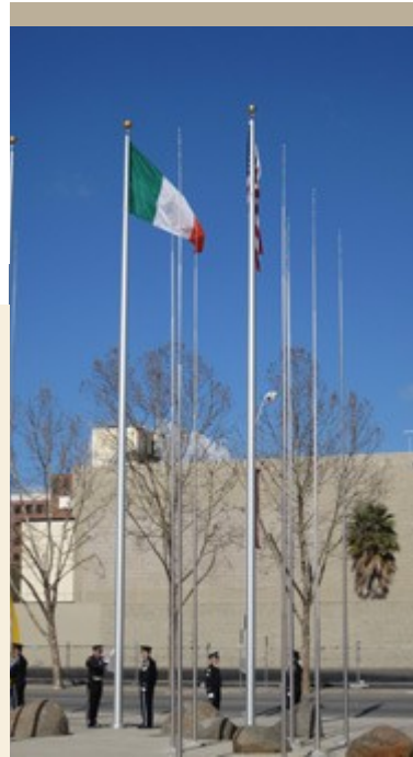
The Irish Flag is flown ceremoniously over San Jose City Hall

All of these proposals will be the subject of much public debate. The City of San Jose uses a community-based budgeting process to help ensure that our decisions reflect the values and priorities of our community. You can stay informed and make your opinion on these issues heard. Check the City's Web site to find information about the budget. Meetings to share information and hear public comment about the budget will be held in every City Council District starting in March. The City Council will hold study sessions for two weeks in May, and public hearings are scheduled for May 18 and June 14.