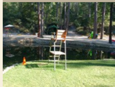
San Jose Family Camp Swimming Area