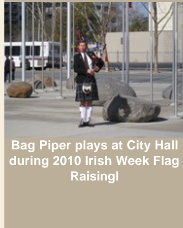
Bag Piper plays at City Hall during 2010 Irish Week Flag Raising