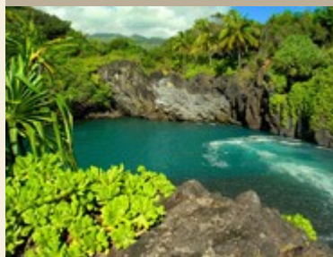
Venice Falls, Maui