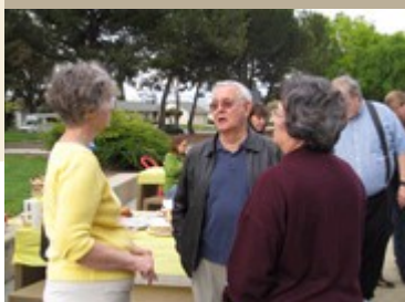
The Playa Del Rey Neighborhood Association Meet & Greet was a success! Neighbors shown above enjoyed the dessert potluck.