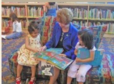
Almaden Children's Library