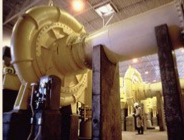
San Jose Water Pollution Control Plant