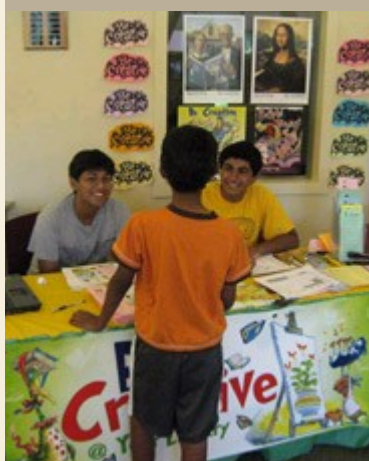
Children's Reading Signup