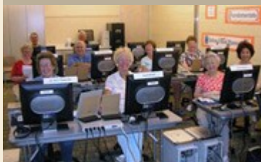
SeniorNet Class at Almaden Community Center