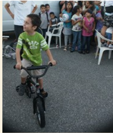
Almaden Kiwanis and Good Karma Bikes hosted a bicycle giveaway at the Hoffman via Monte National Night Out