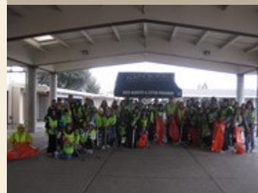
2011 Great American Litter Pick Up at Pioneer High School