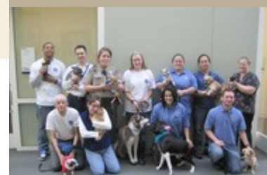
The Animal Care & Services Division led the November 1st Council Invocation in honor of Animal Shelter Awareness Week.