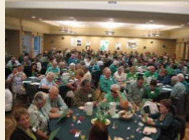
2011 Almaden Senior St. Patrick's Luncheon at the Almaden Community Center