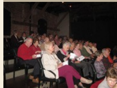
Senior Downtown Day Group Shot at the Tabard Theater waiting to see Stompin' at the Savoy.