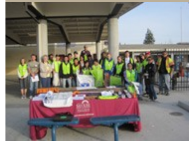
Great American Litter Pick Up at Pioneer High School