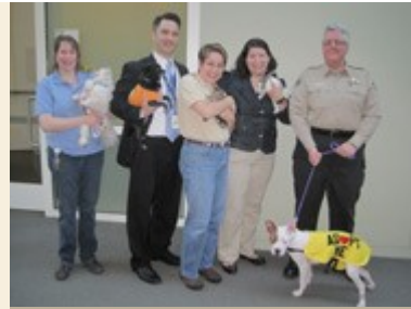
Animal Care and Services Division lead the November 2nd Council Invocation in honor of Animal Shelter Appreciation Month.

Invocations are a period of between 3 and 5 minutes that start the City Council Ceremony. Invocations can take place in many forms, most common of which are performances: a song sung or played, a poem read, or a blessing given. Each City Councilmember and the Mayor trade off inviting guests to lead the Council Invocations throughout that year—this year I was responsible for Invocations in the month of November.