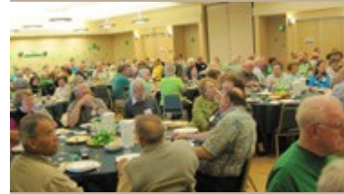
St. Patrick's Luncheon at the Almaden Community Center