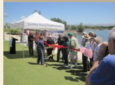
Almaden Lake Park Grand Opening Ceremony