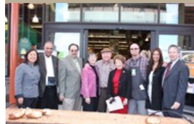
Whole Foods Grand Opening

January 2011 Newsletter print version is available here