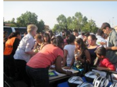
Low income Hoffman Via Monte residents received gifts of backpacks with school supplies and bicycle helmets at National Night Out.