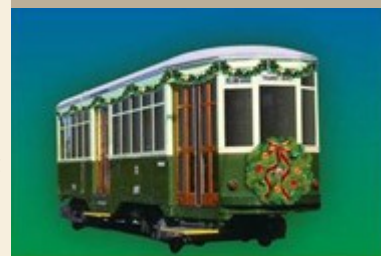
VTA's Historic Trolley the Candyland Express!

Open daily through January 29, 2012 Click here for more information