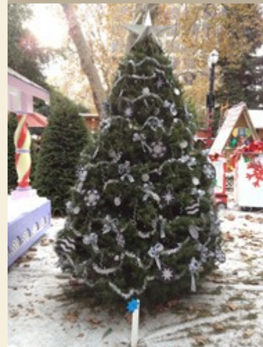
The District 10 team created this tree for Christmas in the Park!