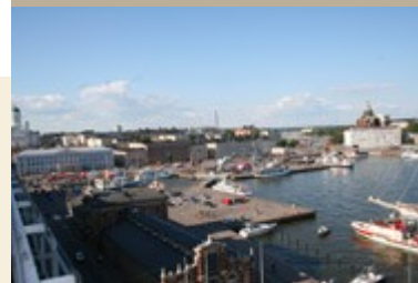
View of the South harbor