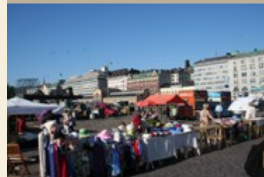
Farmer's Market in Helsinki