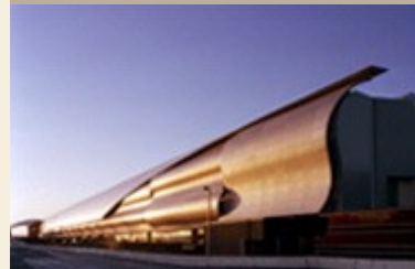
New Terminal at San Jose International Airport