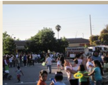
Hoffman Via Monte National Night Out Celebration

Please be aware that NDC staff is frequently in the field. If you need services provided by the NDC, please call to ensure that someone will be