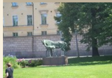
Helsinki Public Art