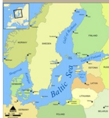
Map of the Baltic Sea region