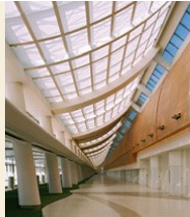
Interior of New Terminal at San Jose Airport

Santa Teresa Golf Course The Charger Invitational Golf Tournament Presented by Leland Booster Club For more information, email jimlizmarino@sbcglobal.net