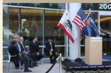
Ericsson Grand Opening