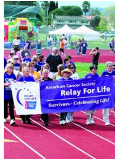
2009 Relay for Life Photo

Arts Calendar – fun things to do around town!