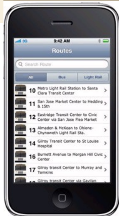
SJ Transit iPhone Application