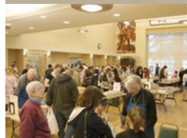
Friends of the Almaden Library Book Sale