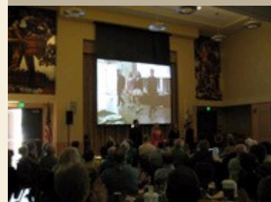
Irish dancers performing