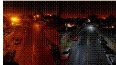
Comparison of current low pressure sodium streetlights with new LED streetlights