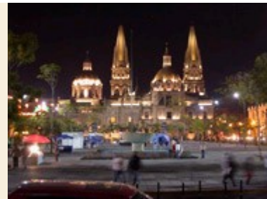
Guadalajara Cathedral by night

The City of San Jose is preparing a Cultural Vision Plan to guide the community's cultural development in the coming decade. This plan will inform Envision San Jose 2040, the update to the City's general plan, and will also function as a stand alone plan for the Office of Cultural Affairs, City government and our partners in the community. It is a noteworthy milestone