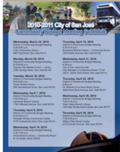
City of San Jose Budget Community Meeting Schedule

April 1st 2010 Newsletter print version is available here