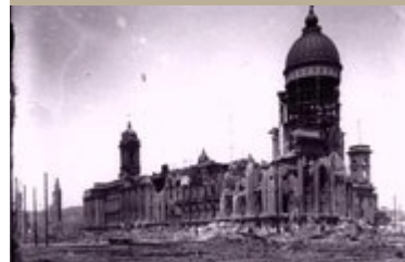
San Francisco City Hall after the 1906 Earthquake

April 25th 10:00 am – 4:00 pm Pioneer High School www.sjdep.org