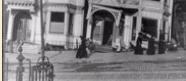
Homes in San Francisco after the 1906 Earthquake

For more information, visit the project cornerstone website: www.projectcornerstone.org/index.htm .