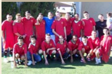
Via Monte Soccer Team