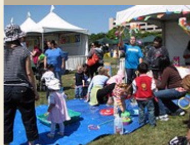
San Jose Children's Faire