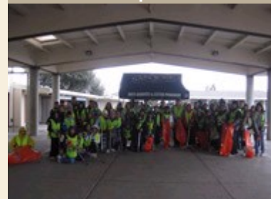
Over 70 people met at Pioneer High School to pick up litter in District 10