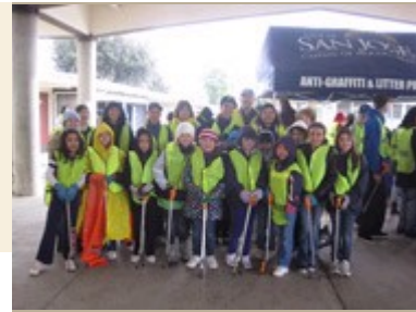
Girl Scout Troop #60093 was a great help with litter pickup

Mercury and San Jose News, predecessors of the Mercury News, in honor of the 200th anniversary of the founding of San Jose and the 125th anniversary of the establishment of the newspapers. The mural consists of a series of scenes that pay tribute to the area's heritage, beginning with native Californians, through Spanish explorers and Mexican rancheros, to the early days of the development of technology leading to Silicon Valley.