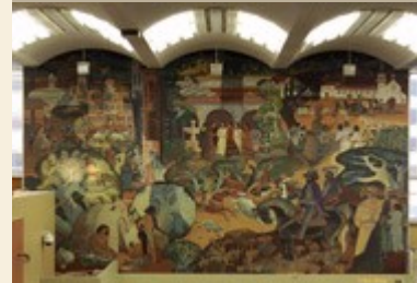
San Jose Airport Mural